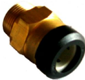
Table of sizes:

This connector with metric male thread is manufactured in sizes 10 and 15 mm . It is designed for the John Guest Cartridge System in compliance with European standards including DIN 73378. The body is made out of brass.