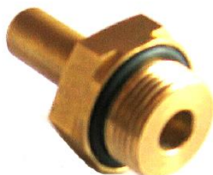
Table of sizes :

This connector is manufactured in sizes 6/ 8/10/12/15 mm . It is designed to be used as a counterpart to clam connectors with the John Guest Cartridge System .Design of this part conforms to European standards including DIN 73378. The body is made out of brass.