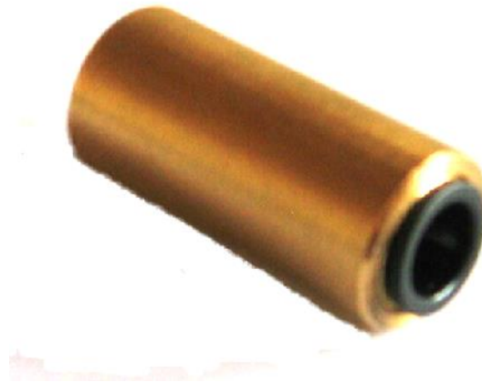
Table of sizes:

This connector is manufactured only in one size 9 mm . It is designed for the John Guest Cartridge System in compliance with European standards including DIN 73378. The body is made out of brass.